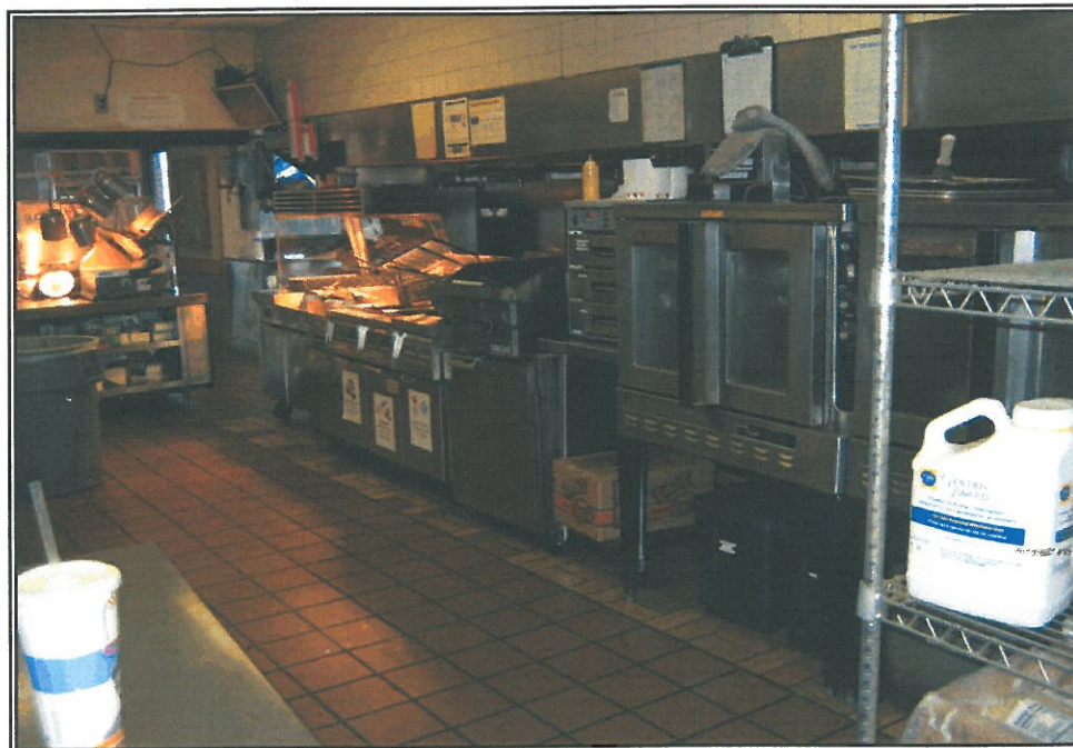
Photograph of the Subject Property