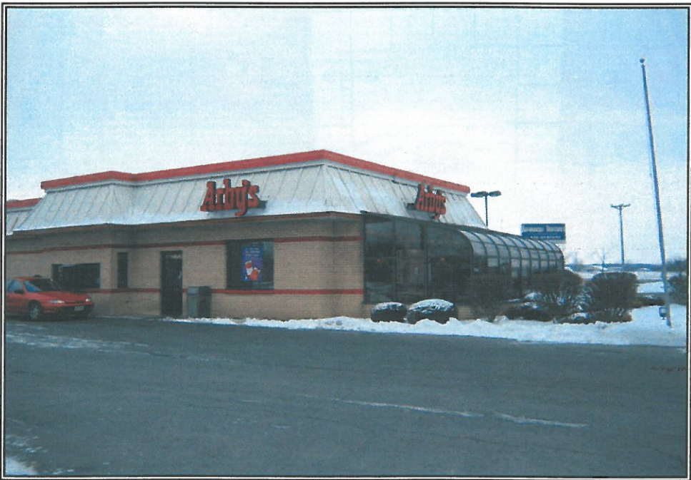
Photograph of the Subject Property