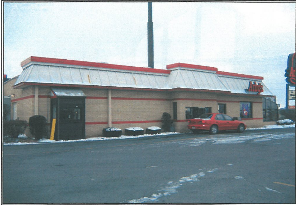
Photograph of the Subject Property