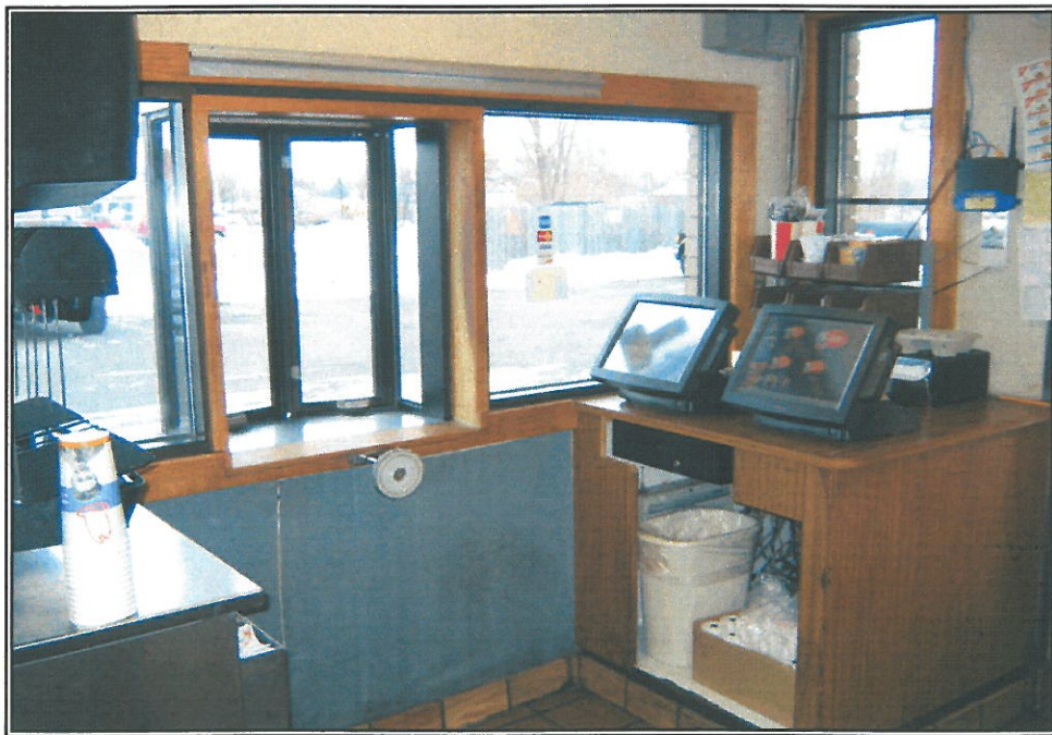
Photograph of the Subject Property