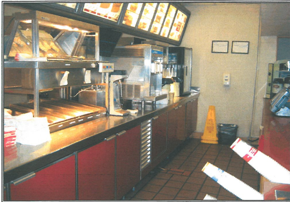
Photograph of the Subject Property