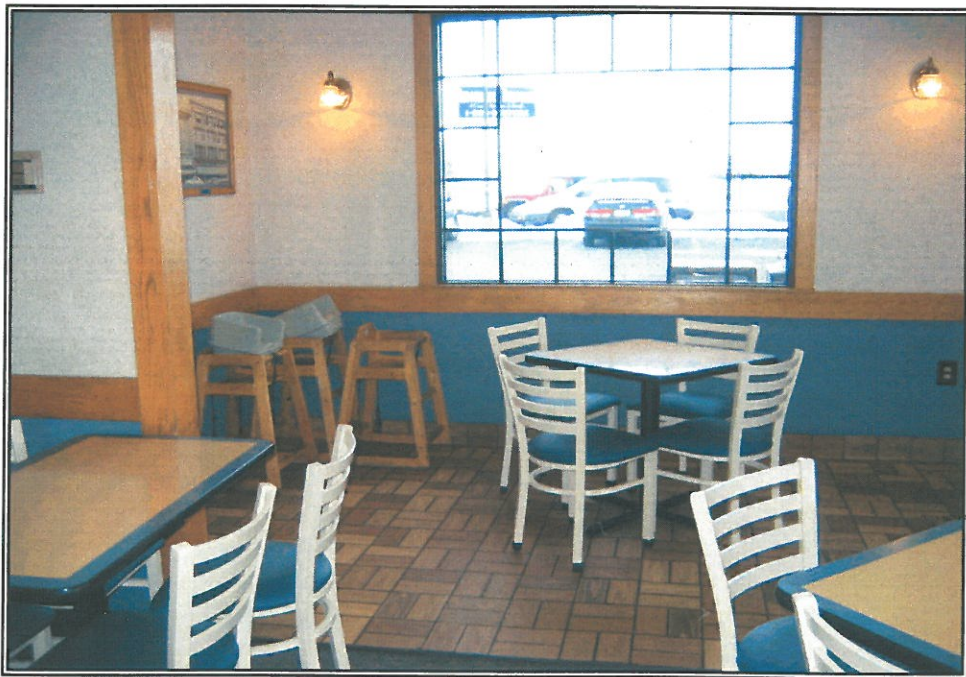
Photograph of the Subject Property