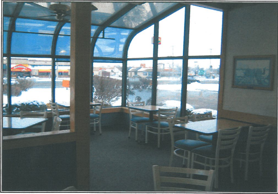
Photograph of the Subject Property